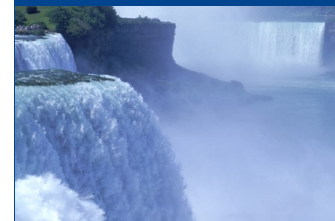
World's most famous Falls