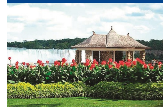
Visit beautiful Queen Victoria Park

Departure: Plaza, 5001 Lincoln Hwy, Matteson, IL @ 8 am