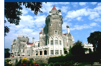
Magnificent Casa Loma Castle in Toronto