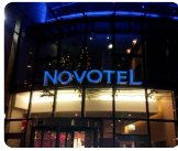
Novotel Paris Centre Gare Montparnasse 17 rue du Cotentin, Paris, Île-de-France, FR, 75015 +33 1 53 91 23 75

Staff will assist with check-in formalities. After which, feel free to explore Paris at your leisure or opt for rest and relaxation(R&R).